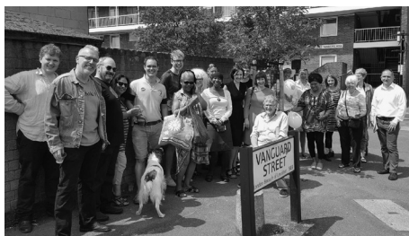
Celebrating 21 trees planted in Vanguard Street

Street Trees for Living is run entirely by volunteers. We have grown by managing